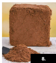
Coco Peat block 5 kg