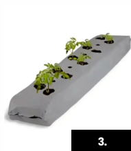
Hydroponics Lay-Flat Grow Bags