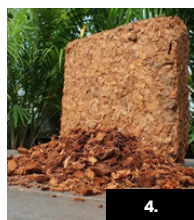
Coco Husk Chips Blocks 5Kg