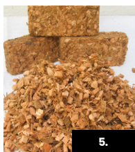
Coco Husk Chips Brick 650 Gram