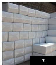
Coco peat bale 25 kg