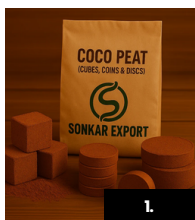
Coco Peat (Cubes Coins and Disc)