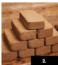
Coco Peat Brick 650 Gram