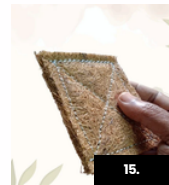
Coco mulch mat